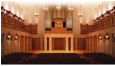
Nihon Univ. CASALS HALL