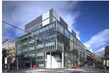
Nihon Univ. Buid. No.1