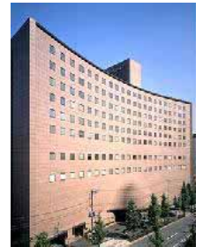
Tokyo Garden Palace