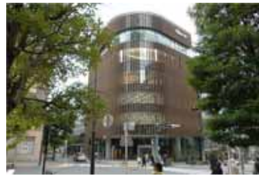
Meiji Univ. Shikonkan